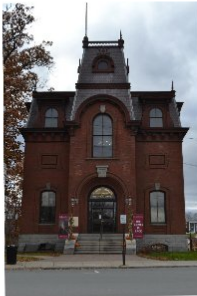
Support the Athenaeum

Your investment in the Athenaeum supports events, buys books and other library materials, maintains the unique art gallery, and allows us to continue serving St. Johnsbury, the Northeast Kingdom, and visitors from around the world.