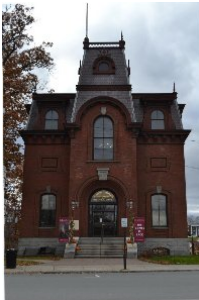
Support the Athenaeum

Your investment in the Athenaeum supports events, buys books and other library materials, maintains the unique art gallery, and allows us to continue serving St. Johnsbury, the Northeast Kingdom, and visitors from around the world.